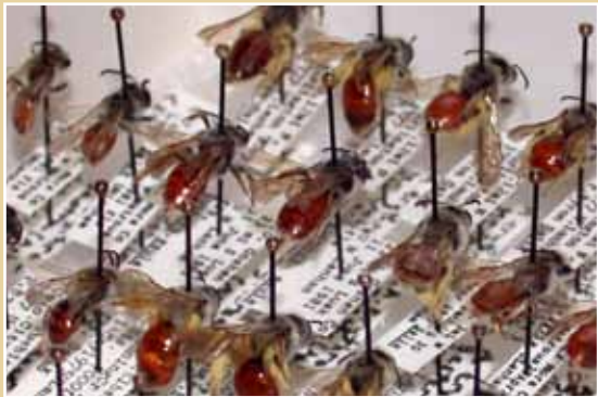
Andrena erythrogaster