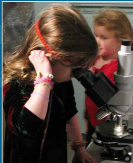
Learning about diatoms

NOW YOU CAN DONATE ONLINE! Go to the Museum website and click on "Get Involved."