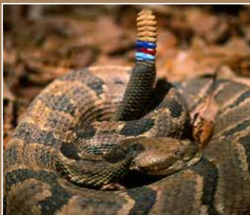
Timber Rattlesnake ( Crotalus horridus )

The mere notion of “snakes” can conjure up fear for some and awe for others. But like them or not these limbless reptiles are an important part of our environment and society. The vast diversity of snakes may be surprising to some who are not aware of just how diverse this group of organisms is but their importance in our environment should be known to all. Although many snakes are venomous and can pose a threat to humans they are very useful in that they are prey for many other organisms, like birds, and eat numerous rodents. One example is India where it is often illegal to kill snakes. These laws exist because mice and other rodents often decimate crops throughout much of the country which the economy and an overpopulated society depend on. Populations of snakes greatly reduce the number of rodents and thereby reducing the amount of devastating crop loss due to the rodents. Equally as exiting and interesting as snakes are other animals with similar exhibits in the Changing Gallery such as bees and grasshoppers.