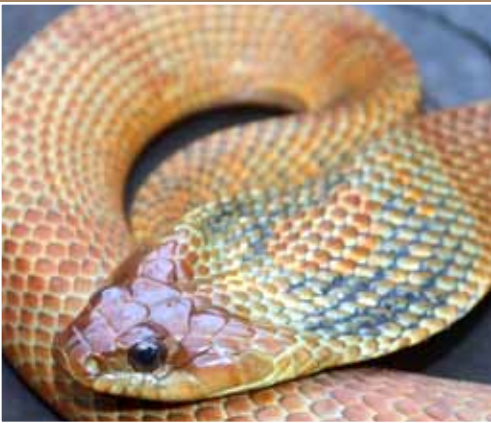
Amazon False Fer-de-lance ( Xenodon severus )