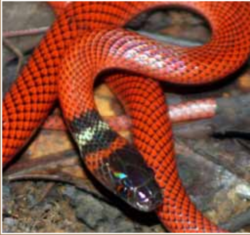
Black-headed Calico Snake ( Oxyrhopus melanogenys )