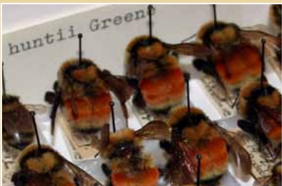
Bombus huntii

Bees. To some, the word brings to mind thoughts of delicious honey buns or fruits dripping with juice. To others, it means the sting that comes with a misplaced foot. To a lucky few, it conjures up the myriad of forms and life histories that encompass the diversity of these fascinating insects – the bees.