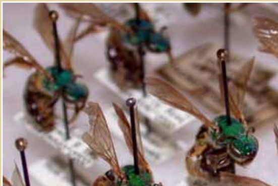
Agapostemon coloradinus